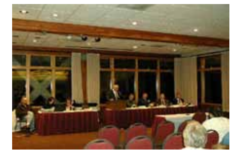
Client Representation and Expert Testimony for:

You can trust the Abbey Road Group to provide representation and support in public meetings and hearings that move the project forward. The team is familiar with the requirements of handling public situations and is skilled in orally and visually presenting the client's development plans to the public with confidence and clarity. Additionally, our familiarity with local jurisdictions and their code allows for testimony that uses jurisdictional codes and rules to the client's advantage.