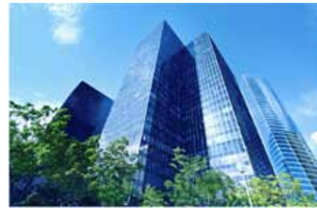
Development Design Services

The Abbey Road Group development design team is experienced in handling projects of all sizes and scopes. The team is ready and willing to handle even the toughest problem projects, providing innovative solutions that meet project needs.