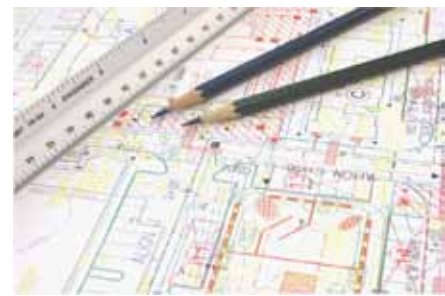
Development Engineering Services

Let the development engineering department at the Abbey Road Group provide more value for your development dollar while helping you to design your project!