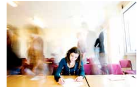
Development Permitting Services

Trust your development permitting to the experts at the Abbey Road Group!